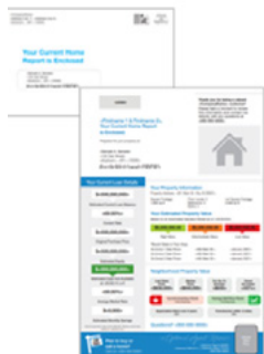
ANNUAL HOME REPORT