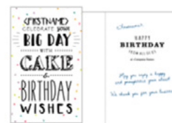
ANNUAL BIRTHDAY CARD