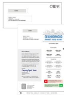
ANNUAL NEIGHBORHOOD REPORT