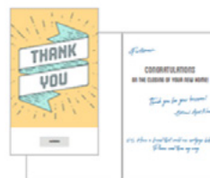
30 DAY POST-CLOSING THANK YOU CARD